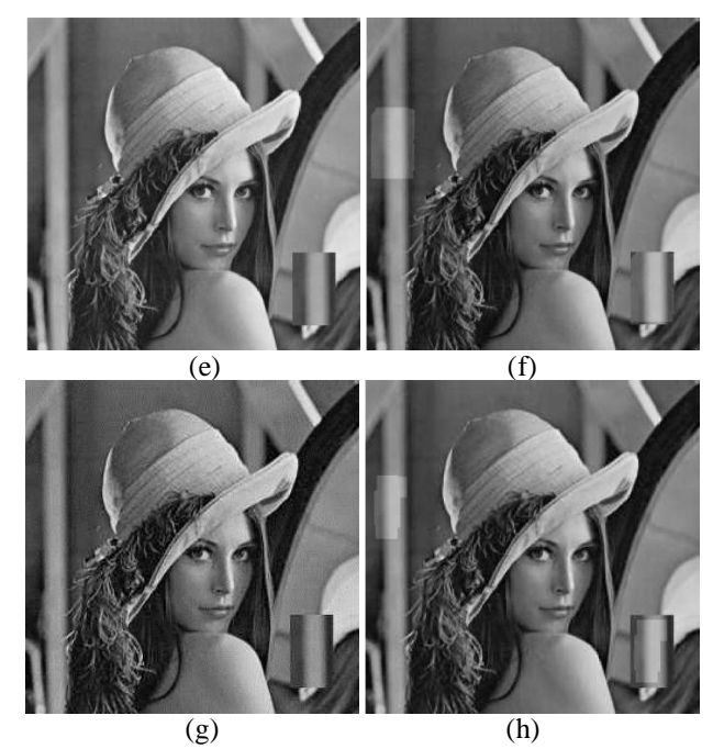
Fig. 2. (a) one copy-move forgery image, (b) the proposed forgery detected result of (a), (c) the JPEG QF=95 of (a), (d) the proposed forgery detected result of (c), (e) the JPEG QF=75 of (a), (f) the proposed forgery detected result of (e), (g) the JPEG QF=50 of (a), (h) the proposed forgery detected result of (g).

Table 1 lists the true positive rate and false positive rate between the proposed scheme and EB algorithm [10]. The true positive rate is defined by the rate of an algorithm identifies the forgery pixels in a forgery region. The false positive rate defines the ratio of an algorithm recognize not forgery pixels as a forgery region. Table 1 shows that the proposed scheme has better detection results than EB algorithm. Moreover, Table 1 also shows that the detection rate is decayed according to the image quality reduction by higher JPEG compressions.